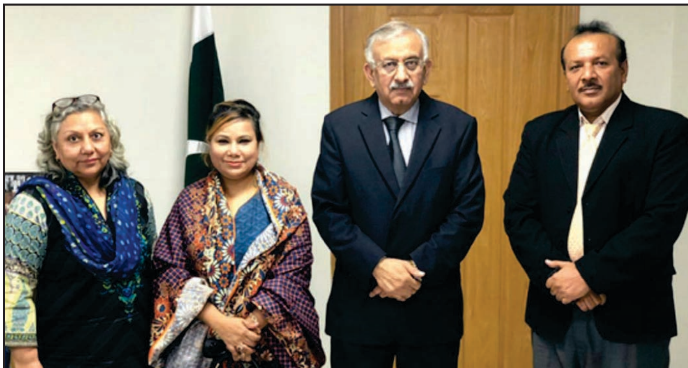
Vice Chancellor, Nursing Advisor, DGN, and Controller SNEB during JSMU Visit