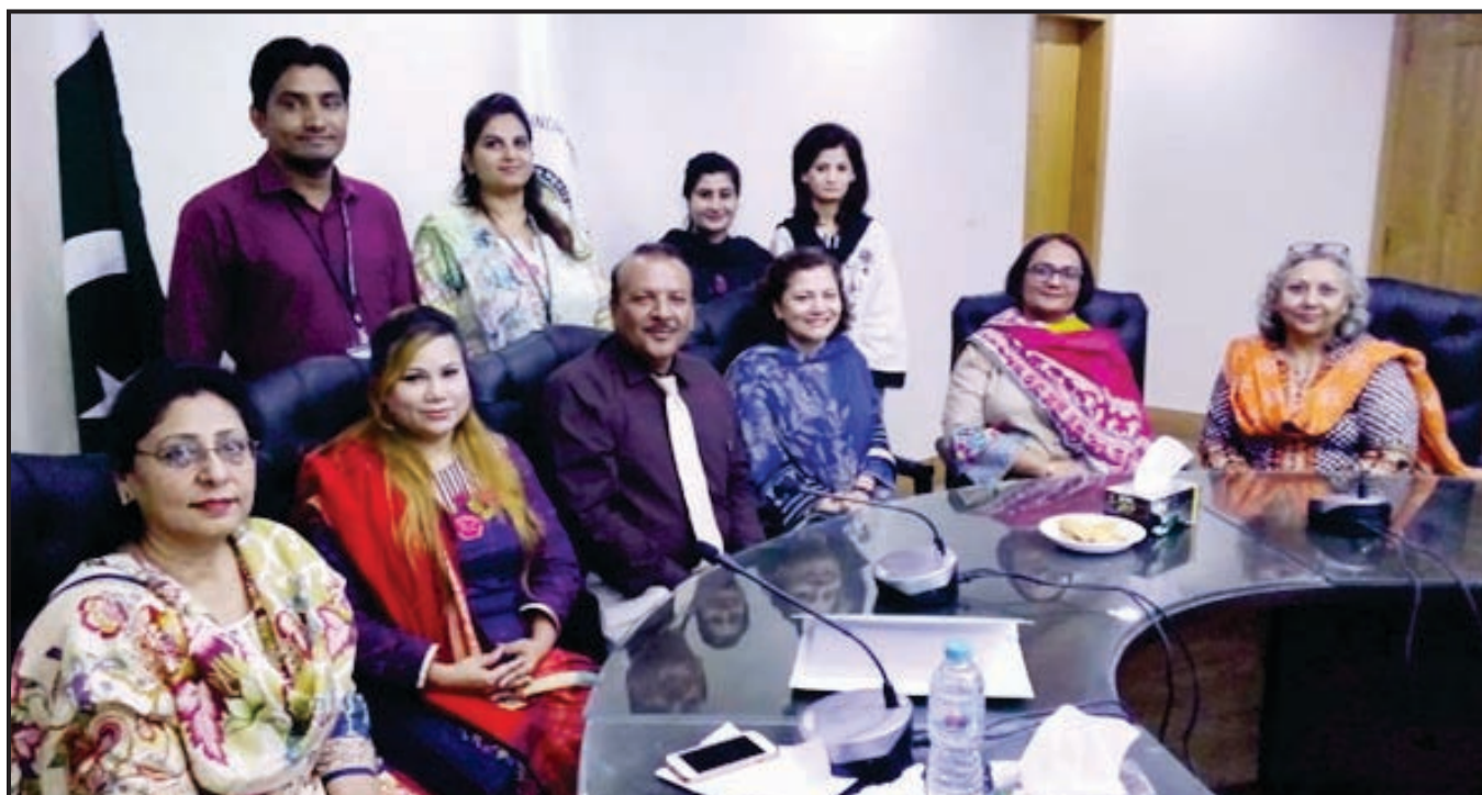
PNC Inspection Team, Pro-Vice Chancellor, Registrar, Nursing Advisor, and Faculty Members During Visit at JSMU